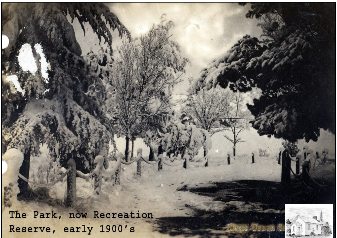
The Park, now Recreation Reserve, early 1900's

Email: awards@volunteeringvictoria.org.au