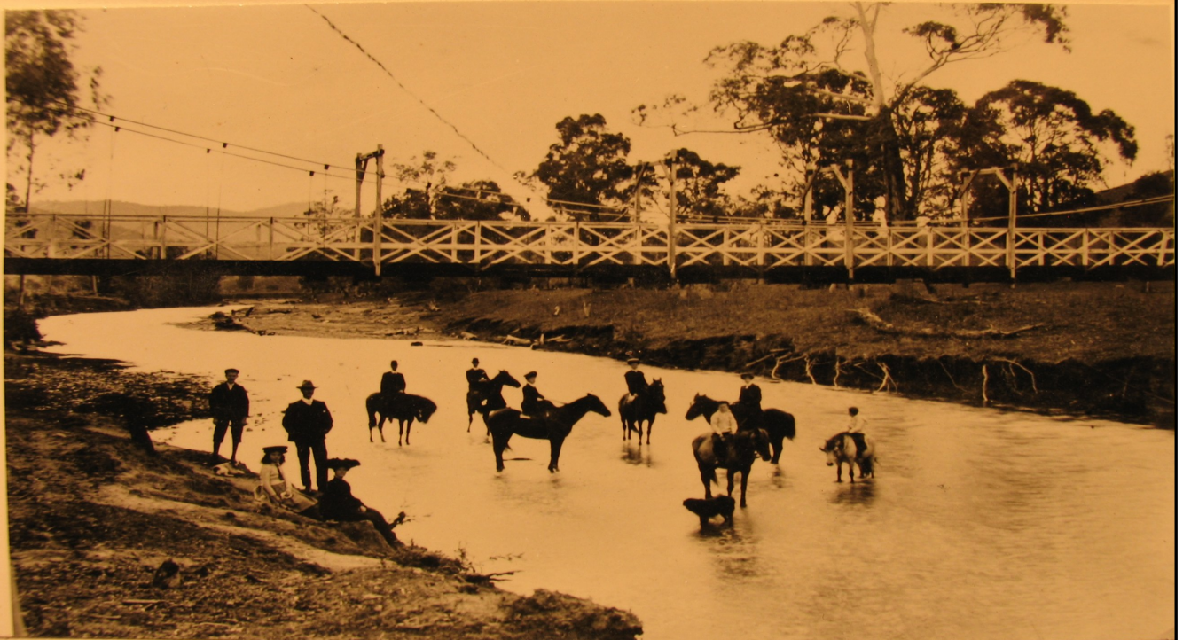
The Grecian Bend - Omeo to Glen Wills Road. ®