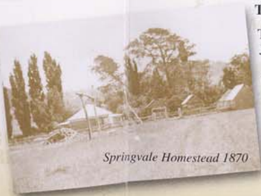
Springvale Homestead 1870