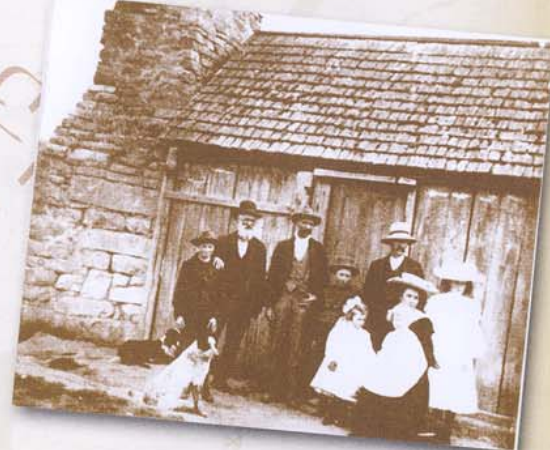
Mt Leinster Homestead 1890's